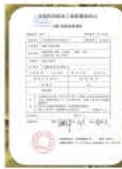
Tongji Hardness Report