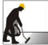
Rinsing and cleaning for each grinding step