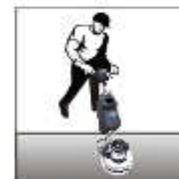
Polishing with single disc polisher MRK-175