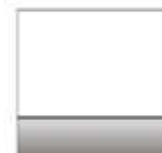
Keep 12 hours