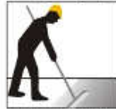
Put on curing agent