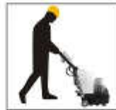
500# 800# 1500# polishing