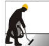
Rinsing and cleaning for each grinding step