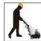
Stone grinding (50# 150# 300# 500# 800# 1000#)