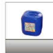
Put on MRK-0#