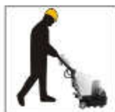
Stone grinding: (50# 150# 300# 500# 800# 1000#)