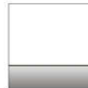
Wait for dry