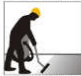
Cleaning after keep moist state at least 2 hours