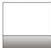
Keep 5 hours