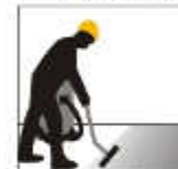
Cleaning after keep moist state at least 2 hours