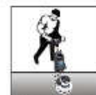
Polishing with single disc polisher MRK-175-2.5