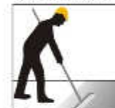
Put on curing agent