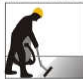
Rinsing and cleaning for each polishing step