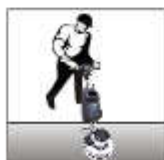
Polishing with single disc polisher MRK-175