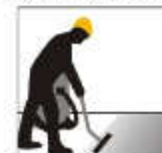
Rinsing and cleaning for each polishing step