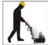
50# 150# 300# grinding